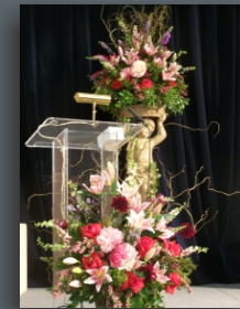
Your lectern can be part of your overall decor.