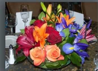
Floral centerpieces are always in fashion