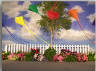
A stage with a spring theme put attendees in an upbeat mood