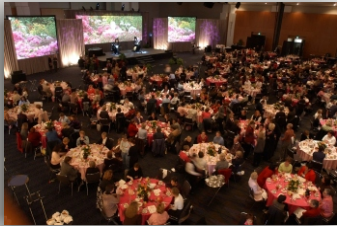
Brunch in a garden there are many ways we can bring the outdoors in