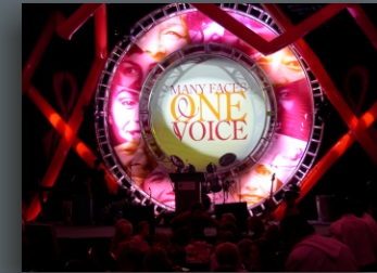
A conference logo becomes a stage design