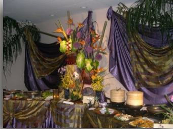
A decorated Thai buffet enhanced the cuisine